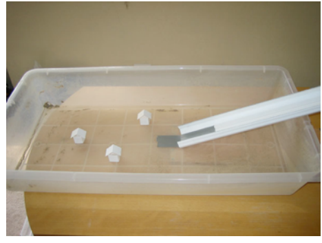
Figure 2. Landslide table

Once you have collected the data from your landslide table, you will share the data with your classmates. We will collect data from slopes around the school as a class before the experiment. Finally, you will need to write a discussion to answer our research question... "Will VSA have another landslide?"